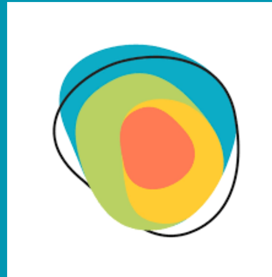
Projecto Novas Descobertas Portugal

An intentional community founded in 1991 regrouping more than 100 people on 15 hectares. Also an international seminar center focused on developing and implementing practical models for a socially and ecologically sustainable way of life.