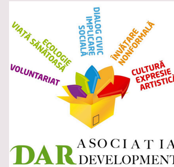
DAR Development Romania

An educative and transformative center which delivers transformative, nature-connected learning experiences that promote personal development, create community connections, and encourage active citizenship, for people of all ages and backgrounds.